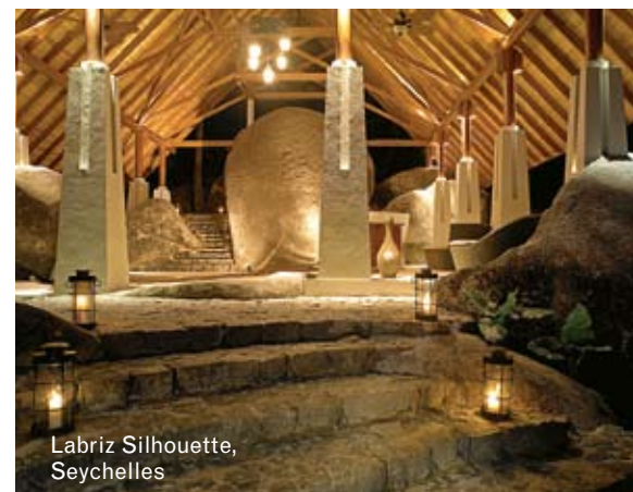
Labriz Silhouette, Seychelles

➤ In trying to be healthy, some things are beyond your control, so go beyond those things. Happily floating in the Indian Ocean, Silhouette Island in the Seychelles is home to Labriz Silhouette resort, where you can retreat poolside, beachside or jungleside. The on-site Aquum spa combines all of these. Start in the relaxation villa and Spa Beach. Then move to Creole-inspired body-soothing rituals that use local ingredients sensitive to your body in treatment areas tuned to the surrounding environment. Get lost in the granite boulders, jungle showers, crashing waves and aromatherapy steam rooms. Escape to find the wellness that's escaping you. labriz-seychelles.com ■ ISLANDS.COM/best