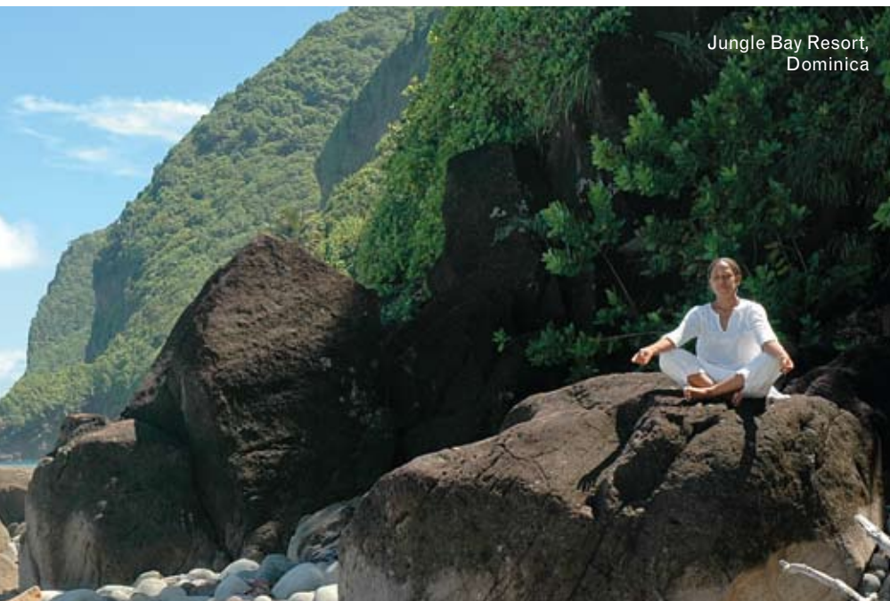
Jungle Bay Resort, Dominica