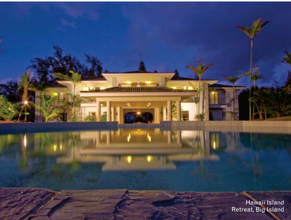
Hawaii Island Retreat, Big Island