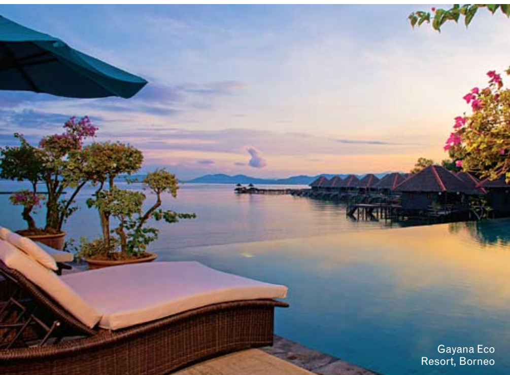
Gayana Eco Resort, Borneo

Treat your body well; treat your spirit well. Isn’t that what retreat means?